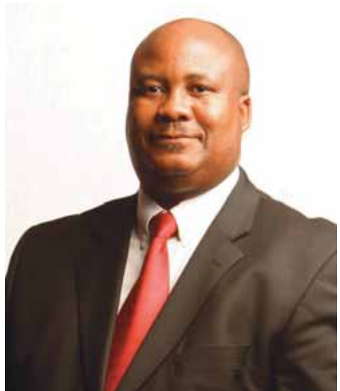
Speaker of the Mpumalanga Provincial Legislature, Mr Siphso Lubisi.

The ideals that buttress South Africa's foreign policy include, among others, democracy, human rights, human dignity, non-racialism, non-sexism and prosperity to all. "Progress and Challenges of Democratisation in Africa" is an appropriate theme for the 41st CPA Africa Region conference as it accords delegates the honour to take stock of progress or lack thereof in the advancement of an African agenda during this 21st century. These political, social and economic imperatives make up the setting and context within which the organisation of the event will be carried out.